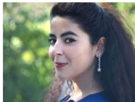
Gala El Hadidi Mezzo-Soprano